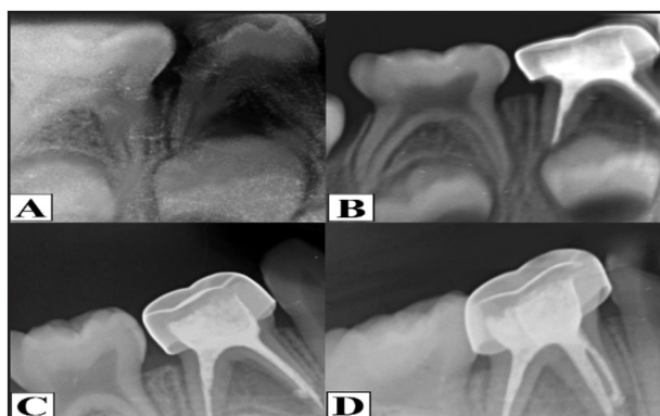
Figure (3): (A) Preoperative, (B) Postoperative, (C) After three months follow up and (D) After six months follow up radiographs for Hesperidin and Zinc oxide pulpectomy in mandibular first primary molar.