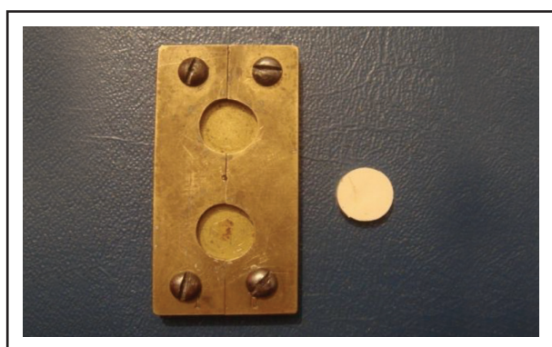
Fig. (1) Split circular brass mold used to create disc samples

One hundred and twenty samples, (40) of each material were prepared in the form of discs (10 mm diameter and 2 mm thickness) using especially designed custom made split brass mold (fig.1) with two mold cavities, and these samples were randomly divided into 4 subgroups for the solutions (n=10)