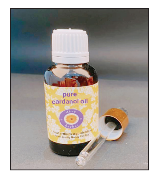
Figure (2) Pure cardanol oil as a natural bio-modifier

Research ethics committee approval (REC) was obtained from faculty of dental medicine for girls Al-Azhar University at code REC-OP-21-08. All teeth obtained from patients who signed consents of approval of using their teeth. A total number of forty-two human sound premolars were collected from patients aged between 20-45 years. The selected teeth were cleaned from calculus and soft tissue remnants using an ultrasonic scaler (Cavitron, Dentsply, USA). All teeth were stored in normal saline<sup>(10)</sup> at room temperature to be used within one month.