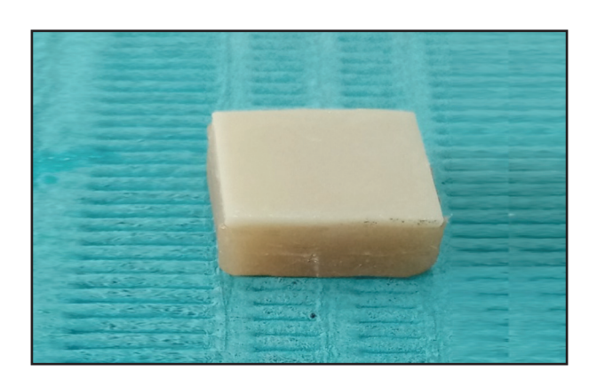
Figure (1): Ceramic veneer cemented to composite resin substrate

9% hydrofluoric acid was used for surface treatment of ceramic veneer by etching for 20 seconds then rinsing the fitting surface with water then application of silane coupling agent (Rely X Ceramic Primer) was done for 60 seconds. 35% phosphoric acid for 15 seconds was used for surface treatment of composite substrate and then rinsed with water, applying two coats of single bond universal adhesive onto the composite substrate surface and dried for 10 seconds using a gentle stream of air. Application of luting cement by using a second copper mold with dimensions (10×10×5mm) to centralize the ceramic specimen over the composite substrate, standardize and ensure 0.1-0.2mm cement thickness in all the specimens. The composite substrate was placed inside the mold, then the selected shade of the cement was applied. A 250 g of load was put over the ceramic specimen for 20 seconds to get a uniform thickness of cement, a brush was used to remove excess cement. Initial polymerization of the resin cement was started under load for 10 seconds, then light curing for 40 seconds had done for final polymerization of the resin cement. Cemented veneer to composite substrate as in (fig.1).